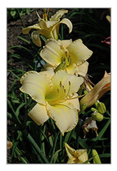
Solar Crest Daylily flowers