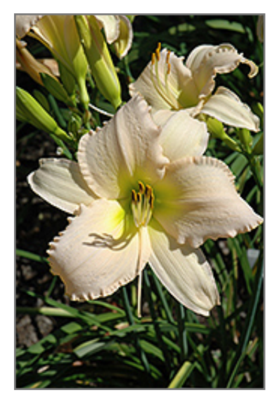
Siberian Sleigh Daylily flowers

Elegant cream trumpets that have a pale pink cast, and green centers that radiate yellow; great grassy texture and form; tetraploid; a spectacular color addition to the garden or border