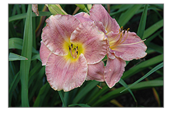
Seurat Daylily flowers