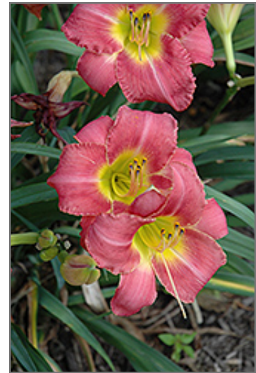
Secondhand Rose Daylily flowers