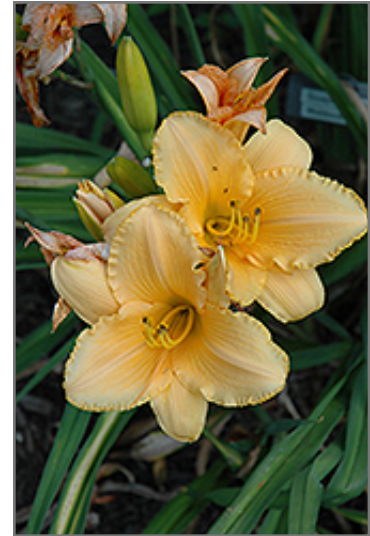
Sculptured Wax Daylily flowers