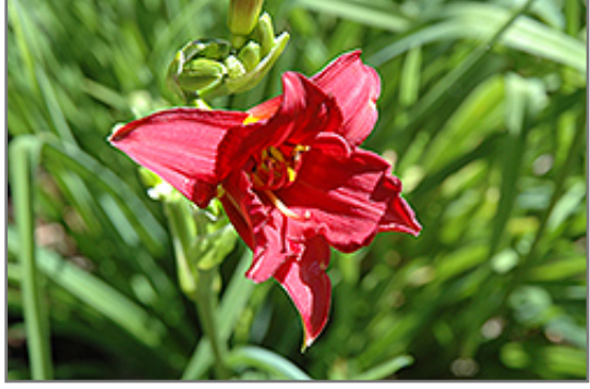
Saucy Rouge Daylily flowers