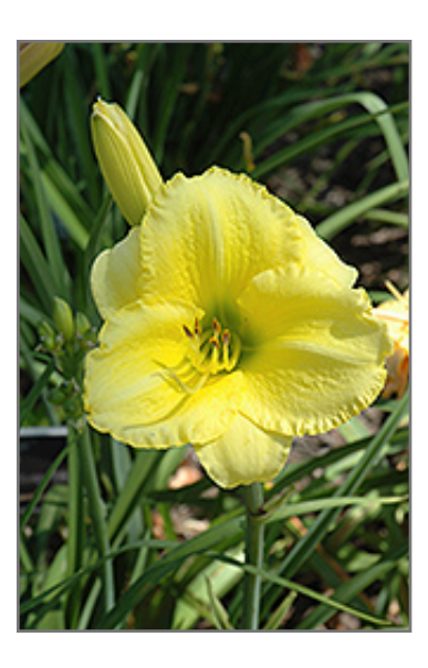
Sanctus Bell Daylily flowers

Radiant, lemon yellow trumpets with green throats; great grassy texture and form; diploid; easy to grow and maintain; a striking addition to the garden or border