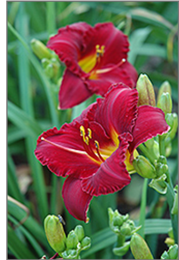
Pygmy Prince Daylily flowers