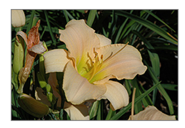
Precious Princess Daylily flowers