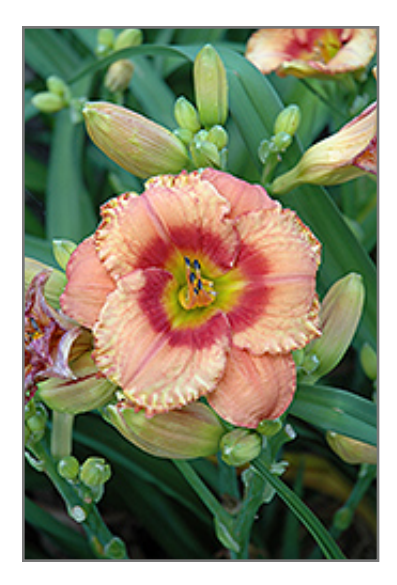
Penny Serenade Daylily flowers

Lovely peach trumpets with yellow-green centers and dazzling red eyezones; great grassy texture and form; tetraploid; a spectacular color addition to the garden or border