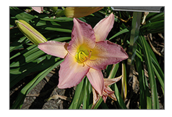
Palace Pearls Daylily flowers