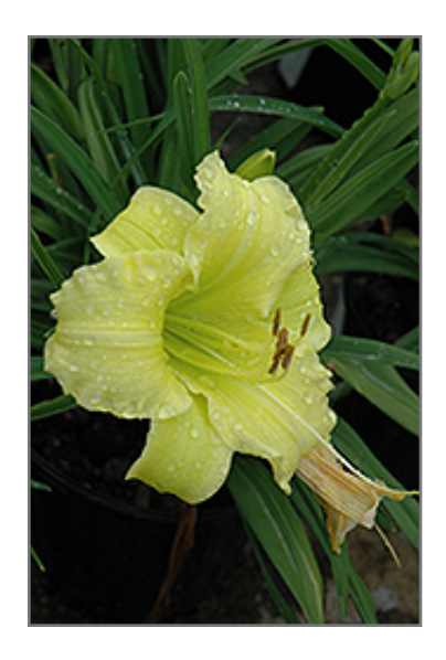
Miss June Daylily flowers