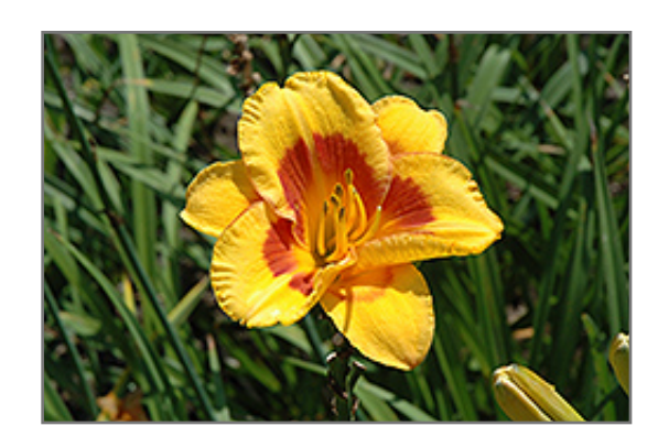
Miniature Mime Daylily flowers