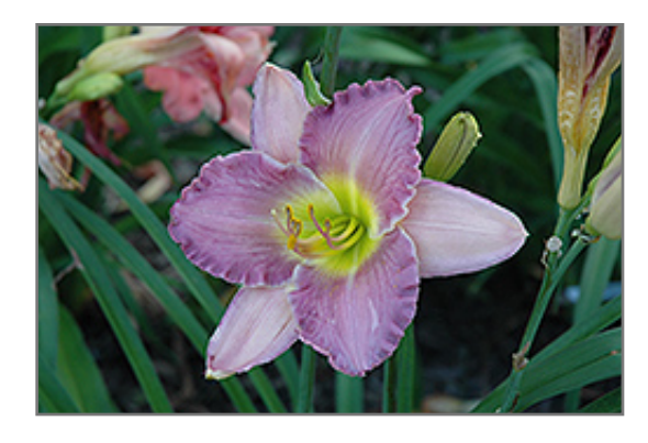
Ming Ballet Daylily flowers