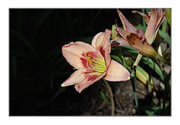
Master Magician Daylily flowers