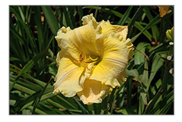
Majestic Move Daylily flowers