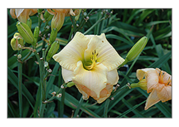
Maid Marian Daylily flowers