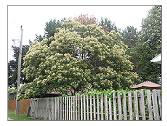
Chinese Chestnut in bloom