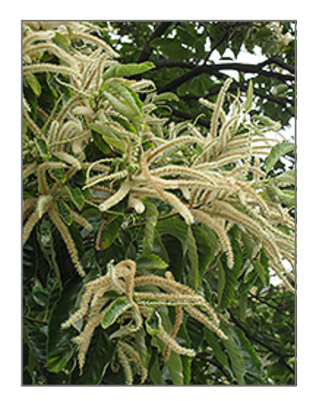
Chinese Chestnut flowers

Chinese Chestnut has dark green deciduous foliage which emerges red in spring on a tree with a round habit of growth. The pointy leaves turn an outstanding harvest gold in the fall. It produces brown nuts in mid fall. The fruit can be messy if allowed to drop on the lawn or walkways, and may require occasional clean-up.