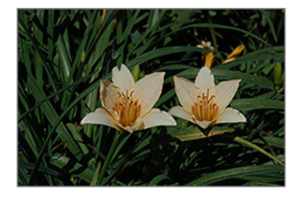
Little Women Daylily flowers