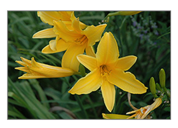
Lemon Lily Daylily flowers