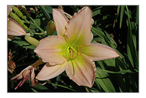
Kwan Yin Daylily flowers