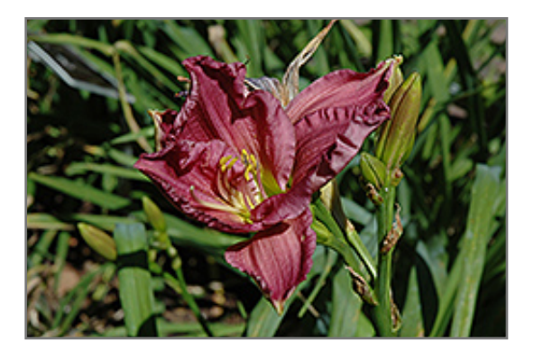
King Of Kings Daylily flowers

King Of Kings Daylily will grow to be about 12 inches tall at maturity, with a spread of 12 inches. When grown in masses or used as a bedding plant, individual plants should be spaced approximately 10 inches apart. It grows at a medium rate, and under ideal conditions can be expected to live for approximately 10 years. As an evegreen perennial, this plant will typically keep its form and foliage year-round.