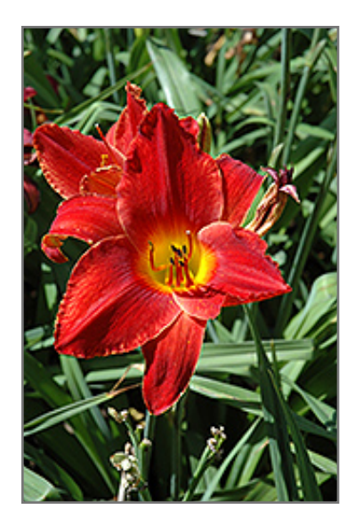
Imperial Guard Daylily flowers