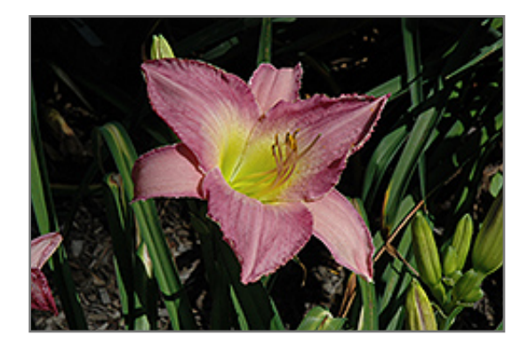
Ilonka Daylily flowers