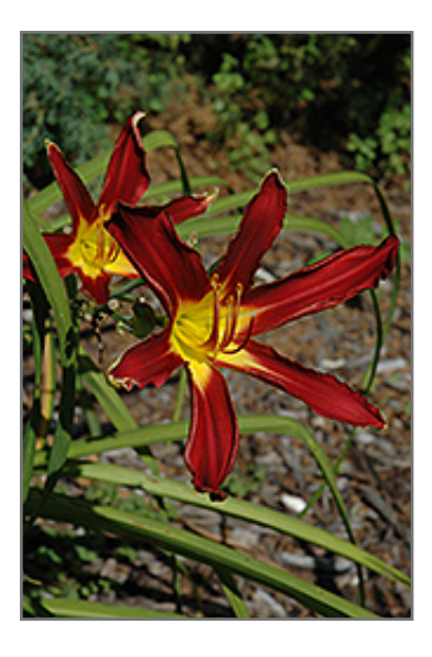
Holly Dancer Daylily flowers

Rich, deep red, spider like blooms with contrasting yellow throats; great grassy texture and form; diploid; this variety, with long, narrow petals is a striking addition to the garden or border