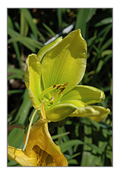
Green Pinwheel Daylily flowers