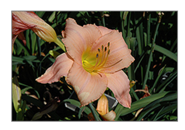
First Waltz Daylily flowers