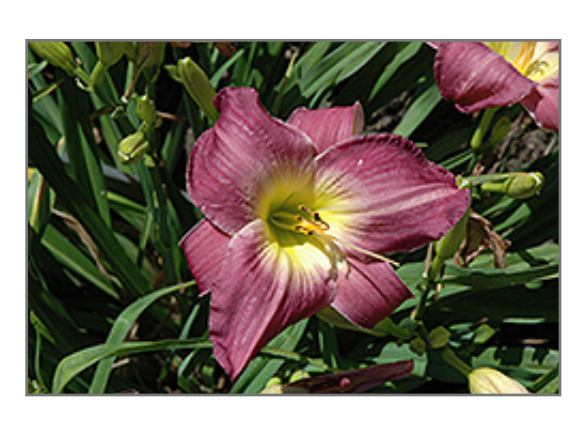
Empress Seal Daylily flowers

Large and long blooming violet trumpets with yellow-green throats and dramatic white flares and streaks; great grassy texture and form; tetraploid; a tremendous color addition to the garden or border