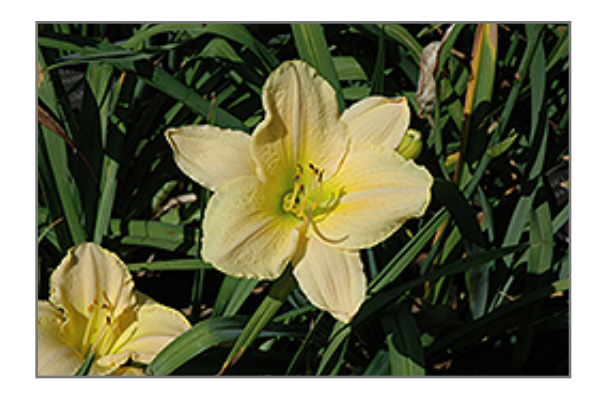
Dalai Lama Daylily flowers