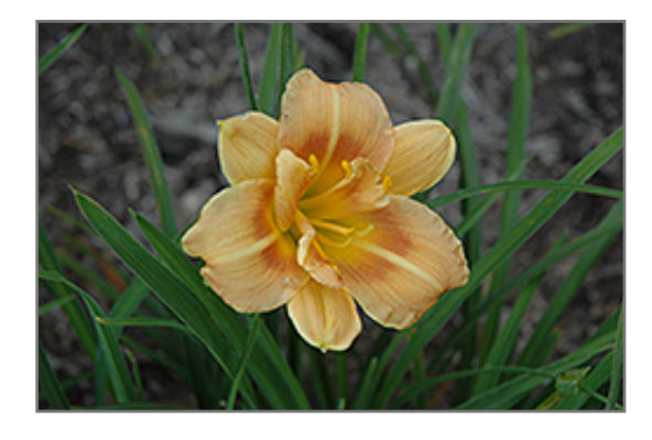
Longfield's Conchita Daylily flowers