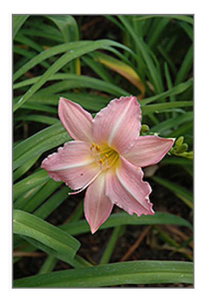
Color Splash Daylily flowers