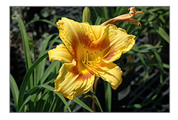
Bumble Bee Daylily flowers