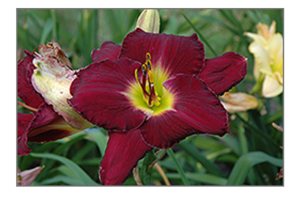
Beaujolais Daylily flowers