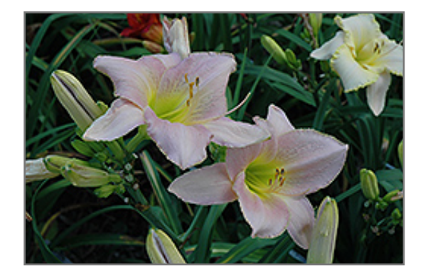
Aspasia Daylily flowers