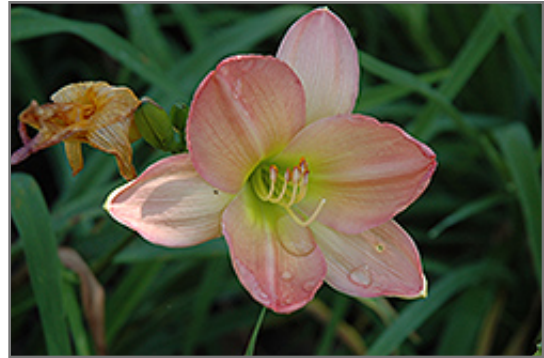
Apple Blossom Sue Daylily flowers