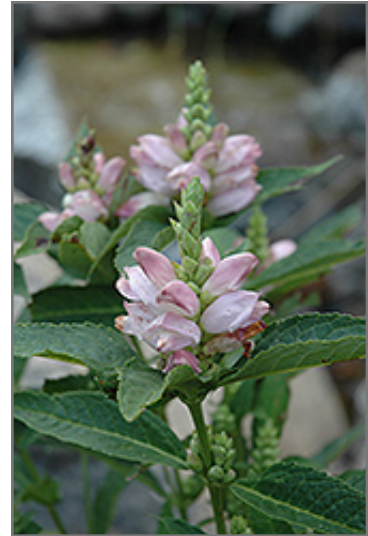
Turtlehead flowers