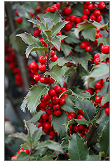
Blue Princess Meserve Holly fruit

Blue Princess Meserve Holly is recommended for the following landscape applications;