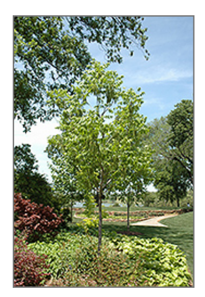
Choctaw Pecan