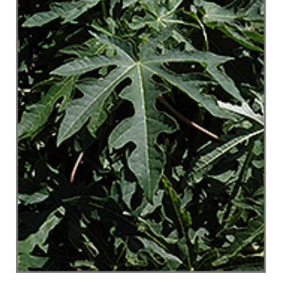
Papaya will grow to be about 20 feet tall at maturity, with a spread of 10 feet. It has a low canopy with a typical clearance of 3 feet from the ground, and is suitable for planting under power lines. It grows at a fast rate, and under ideal conditions can be expected to live for approximately 10 years.

This plant is typically grown in a designated edibles garden. It should only be grown in full sunlight. It prefers to grow in average to moist conditions, and shouldn't be allowed to dry out. It is not particular as to soil type or pH. It is somewhat tolerant of urban pollution. This species is not originally from North America.