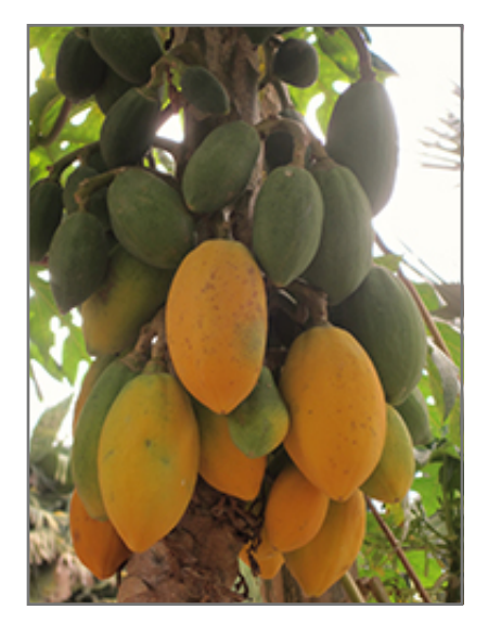
Papaya fruit

Papaya has attractive dark green evergreen foliage on a tree with an upright spreading habit of growth. The lobed palmate leaves are highly ornamental and remain dark green throughout the winter. The fruits are showy gold pomes with a yellow blush, which are carried in abundance in late fall. The fruit can be messy if allowed to drop on the lawn or walkways, and may require occasional clean-up. The gray branches add an interesting dimension to the landscape.