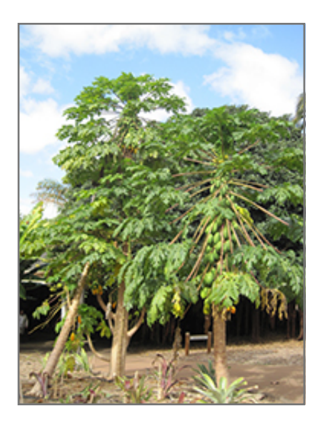
Papaya fruit