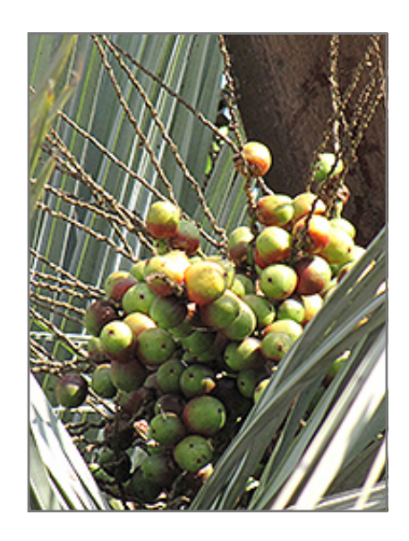
Jelly Palm fruit

Jelly Palm is a fine choice for the yard, but it is also a good selection for planting in outdoor pots and containers. Because of its height, it is often used as a 'thriller' in the 'spiller-thriller-filler' container combination; plant it near the center of the pot, surrounded by smaller plants and those that spill over the edges. It is even sizeable enough that it can be grown alone in a suitable container. Note that when grown in a container, it may not perform exactly as indicated on the tag - this is to be expected. Also note that when growing plants in outdoor containers and baskets, they may require more frequent waterings than they would in the yard or garden. Be aware that in our climate, most plants cannot be expected to survive the winter if left in containers outdoors, and this plant is no exception. Contact our experts for more information on how to protect it over the winter months.