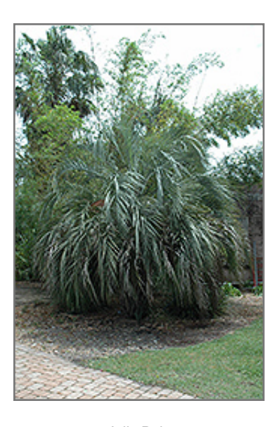
Jelly Palm

This tropical plant does best in full sun to partial shade. It does best in average to evenly moist conditions, but will not tolerate standing water. It is not particular as to soil type or pH. It is somewhat tolerant of urban pollution. This species is not originally from North America.