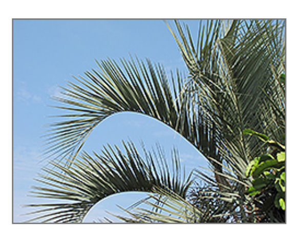
Jelly Palm foliage