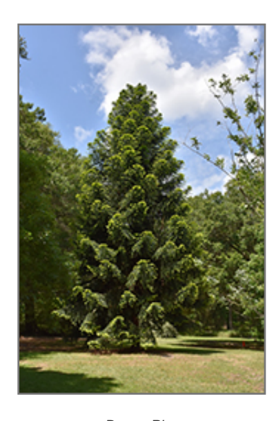
Bunya Pine

This is a relatively low maintenance tree, and usually looks its best without pruning, although it will tolerate pruning. It is a good choice for attracting birds to your yard, but is not particularly attractive to deer who tend to leave it alone in favor of tastier treats. It has no significant negative characteristics.