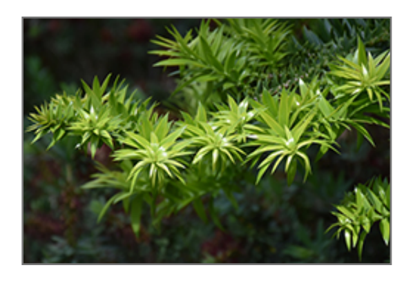
Bunya Pine foliage

Bunya Pine is recommended for the following landscape applications;