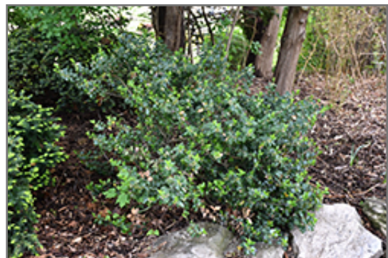
Blue Prince Meserve Holly