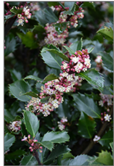
Blue Prince Meserve Holly flowers

Blue Prince Meserve Holly is recommended for the following landscape applications;