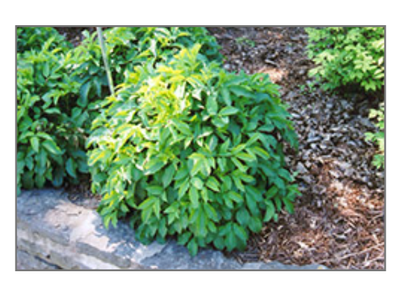
Dwarf European Elder

A compact rounded garden shrub featuring clusters of small, creamy white flowers in spring followed by black berries; very adaptable, more restrained than the species, a far better choice for small-scale garden use, survives with minimal care