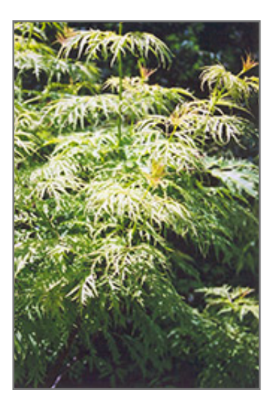
Goldfinch American Elder foliage

Goldfinch American Elder features showy clusters of lightly-scented creamy white flowers held atop the branches in early summer. It has attractive gold deciduous foliage. The compound leaves are highly ornamental and turn yellow in fall. The deep purple fruits are held in clusters in early fall.