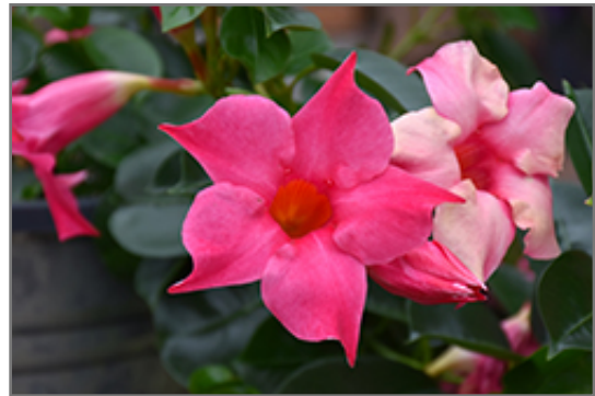
Pink Mandevilla flowers

This plant does best in full sun to partial shade. It requires an evenly moist well-drained soil for optimal growth. It is not particular as to soil type or pH. It is highly tolerant of urban pollution and will even thrive in inner city environments. This particular variety is an interspecific hybrid, and parts of it are known to be toxic to humans and animals, so care should be exercised in planting it around children and pets. It can be propagated by cuttings; however, as a cultivated variety, be aware that it may be subject to certain restrictions or prohibitions on propagation.