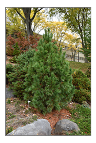
Pygmy Swiss Stone Pine