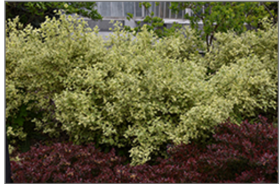
Variegated Mockorange

Variegated Mockorange is recommended for the following landscape applications;