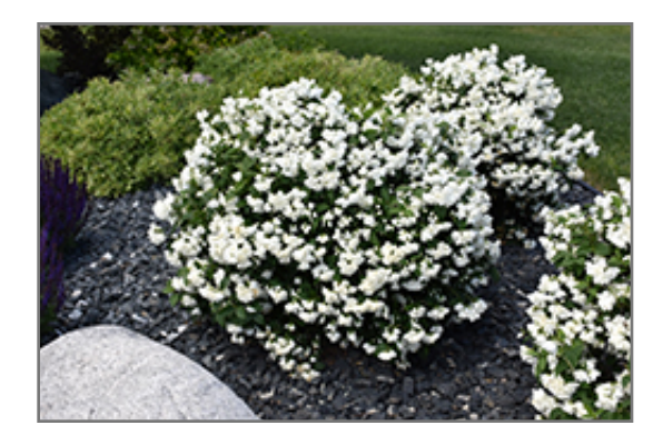
Snowbelle Mockorange in bloom