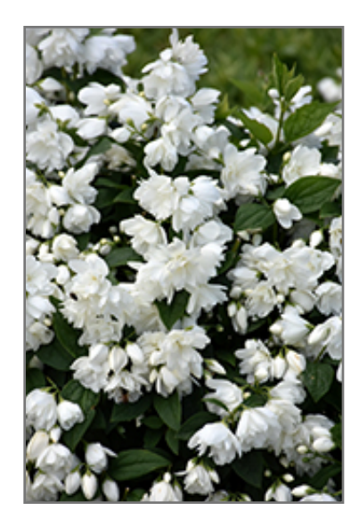
Snowbelle Mockorange flowers