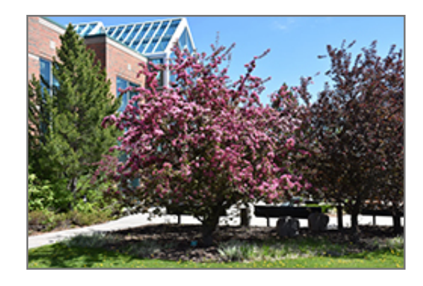
Makamik Flowering Crab in bloom

A fantastic ornamental tree for home landscape use, covered in deep pink flowers in spring and persistent dark red fruit, a large and wide spreading habit of growth, exceptionally hardy; needs well-drained soil and full sun