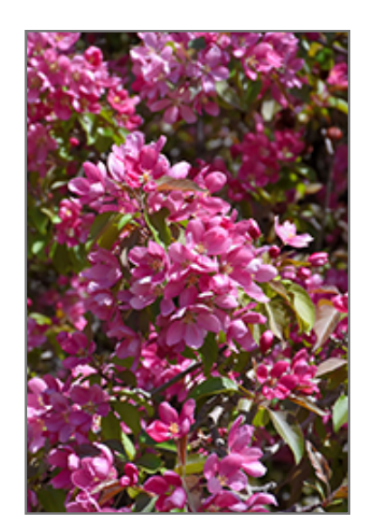
Makamik Flowering Crab flowers

Makamik Flowering Crab is recommended for the following landscape applications;