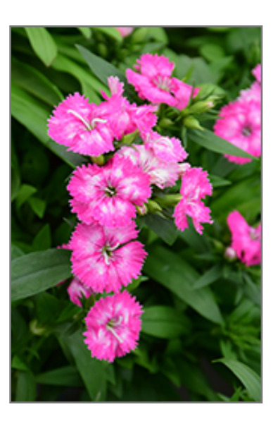
Telstar Pink Pinks flowers

An exceptional garden performer, this variety blooms early in the season and right up to the first frosts; bright green leaves contrast well with the amazing, frilly pink blooms; an excellent choice for rock gardens and edging